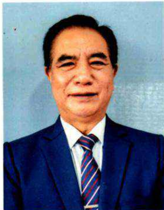
Lalduhoma Chief Minister Mizoram